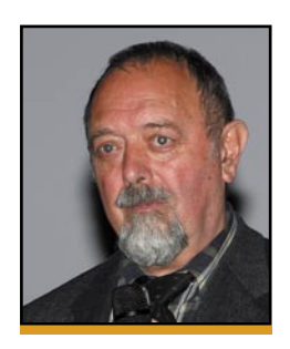
Ingo Potrykus Session Chair

"...The many potential applications of agricultural biotechnology that are being developed in advanced laboratories around the globe promise many benefits if judiciously integrated with other aspects of crop production..."