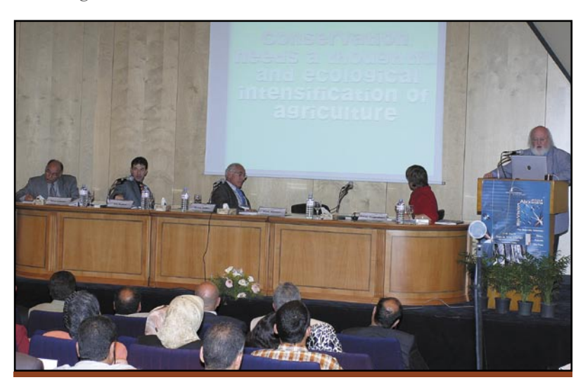
Panel 3 speakers and audience

Agricultural Biodiversity for Sustainable Development: Strengthening the Knowledge Base