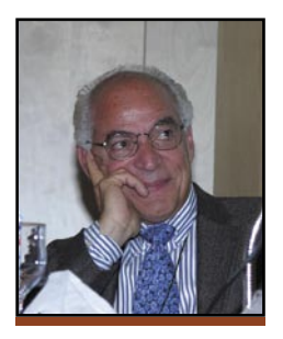
Farouk El Baz

"...Biodiversity is drastically affected by changes to the environment of the biota... In order to fully understand the changes and remedy the resulting problems, we must ascertain the nature of the changes and where and at what rate do they occur. Much can be learned in this regard through the application of remote sensing methodologies, particularly photographing the Earth from space platforms..."