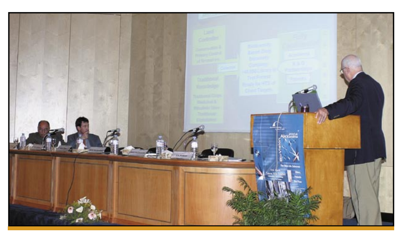
Panel 11 Members

Agriculture Biotechnology: Its Impact on Biodiversity