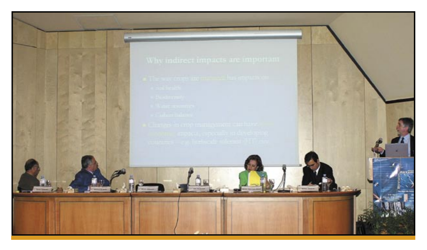
Panel 15 Members